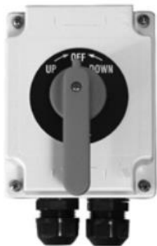
Diagram for BH-USA Red Handle Bremas Switch to motor

This is the procedure for wiring the BH-USA Red Handle Bremas drum switch to a standard color or T wired motor. Please use T numbers or standard color wires from the motor. It is important to note that our instructions do not use colors for the wire coming from the switch, as different manufacturers may wire their harnesses differently. To ensure accuracy, use the location of the wire rather than its color. If you are unfamiliar with the wiring process, we recommend you consult a licensed electrician for assistance.