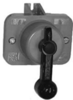
Diagram for Furnas/Hubbell Switch to Standard Color or T Wire Motor

This is the procedure for wiring the Furnas/Hubbell drum switch to a standard color or T wired motor. Please use T numbers or standard color wires from the motor. It is important to note that our instructions do not use colors for the wire coming from the switch, as different manufacturers may wire their harnesses differently. To ensure accuracy, use the location of the wire rather than its color. If you are unfamiliar with the wiring process, we recommend you consult a licensed electrician for assistance.