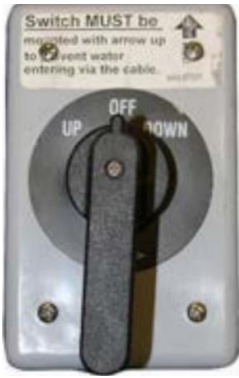
Diagram for Bremas Black Handle Switch to Standard Color or T Wire Motor

This is the procedure for wiring the Bremas Black Handle drum switch to a standard color or T wired motor. Please use T numbers or standard color wires from the motor. It is important to note that our instructions do not use colors for the wire coming from the switch, as different manufacturers may wire their harnesses differently. To ensure accuracy, use the location of the wire rather than its color. If you are unfamiliar with the wiring process, we recommend you consult a licensed electrician for assistance.