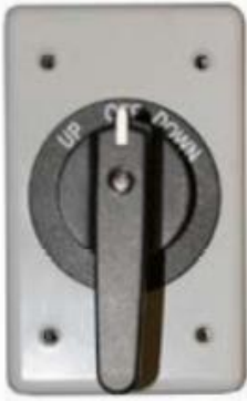
Diagram for AMS Switch to Standard Color or T Wire Motor

This is the procedure for wiring the AMS drum switch to a standard color or T wired motor. Please use T numbers or standard color wires from the motor. It is important to note that our instructions do not use colors for the wire coming from the switch, as different manufacturers may wire their harnesses differently. To ensure accuracy, use the location of the wire rather than its color. If you are unfamiliar with the wiring process, we recommend you consult a licensed electrician for assistance.