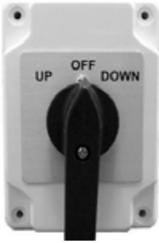
Diagram for ACI Switch to Standard Color or T Wire Motor

This is the procedure for wiring the ACI drum switch to a standard color or T wired motor. Please use T numbers or standard color wires from the motor. It is important to note that our instructions do not use colors for the wire coming from the switch, as different manufacturers may wire their harnesses differently. To ensure accuracy, use the location of the wire rather than its color. If you are unfamiliar with the wiring process, we recommend you consult a licensed electrician for assistance.